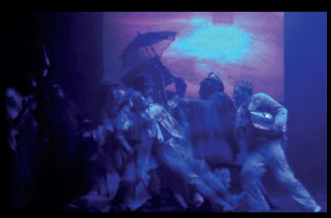
From 'Waiting for Ulysses'

The world of the Theatre de l'Ange Fou, this visionary world of contrasting light and darkness, of metamorphosis, is populated by a family of invented archetypes in unkown yet familiar settings. Throughout their various productions, the Theatre de l'Ange Fou explores the infinite possibilities of the interaction between the corporeal score and the spoken text, music and film.